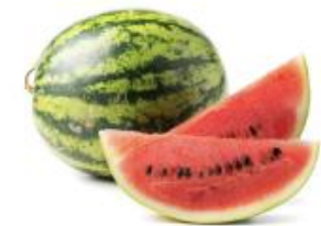
watermelons from South Africa