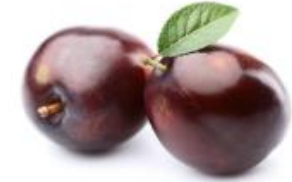
plums from China