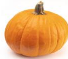
pumpkins from Mexico

Orange and yellow: vitamin A, vitamin C and fibre.