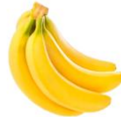
bananas from Brazil