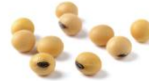
soya beans from Canada