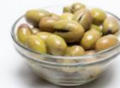
olives from Greece