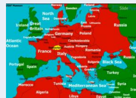
Map of the Nazi Occupation