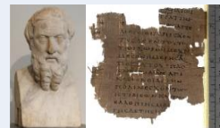
Herodotus 'The Histories'