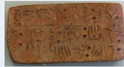
Linear A stone tablet