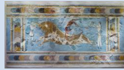
The 'Bull-leaping Fresco'