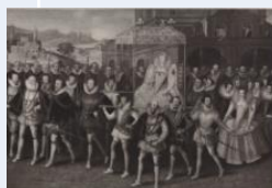
Below: Picture of the Royal Progress of Elizabeth I