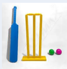
Cricket bat, balls and stumps